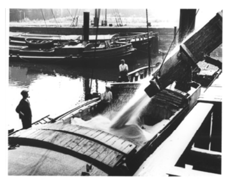
Digging out the common salt and loading into barrows at the transfer point, the chutes were placed over the boats. Anderton Boat Lift.

Salt chutes were used right up to living memory; generally loose salt was transferred from the boat via a barrow down the towpath to the chute and straight into the hold of the waiting boat.