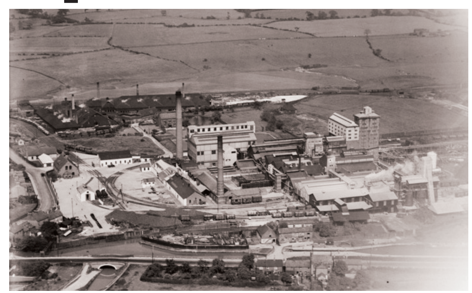
and canal networks. In the background is the open pan works of Murgatroyd's.

Resources were limited and the Norwegian supply proved United States of America.