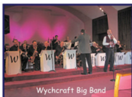
Wychcraft Big Band

AND COUNT BASIE AMONG MANY OTHER COMPOSERS.