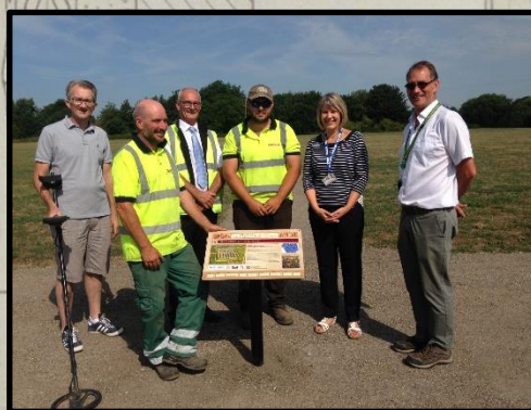
Installation of the Roman Fort pathway and Interpretation panels