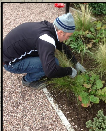
Planting up the new Memorial Garden