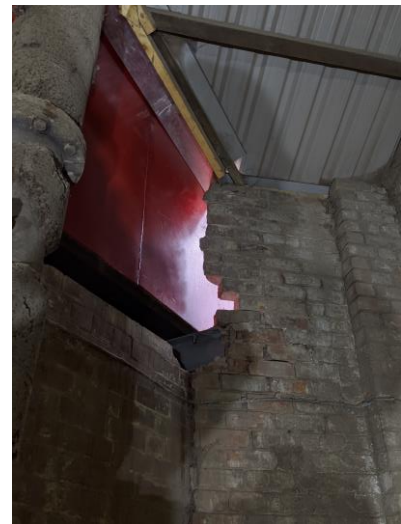
Figure 8 Gaps at the side