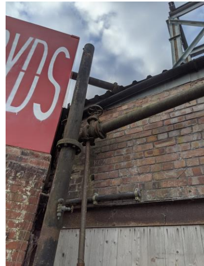
Figure 5 Pipe resting on pole