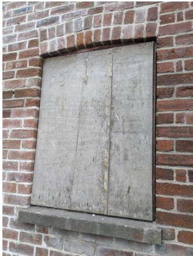
Figure 3 Widows looked at externally