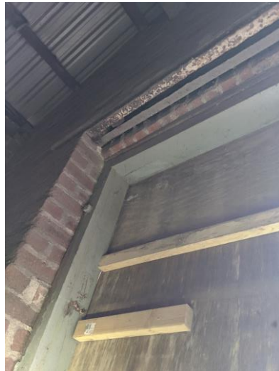
Figure 2 Windows/door frames looked at and scope with contractor