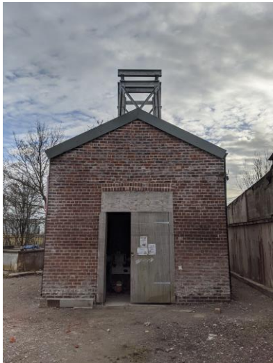
Figure 1 Front elevation