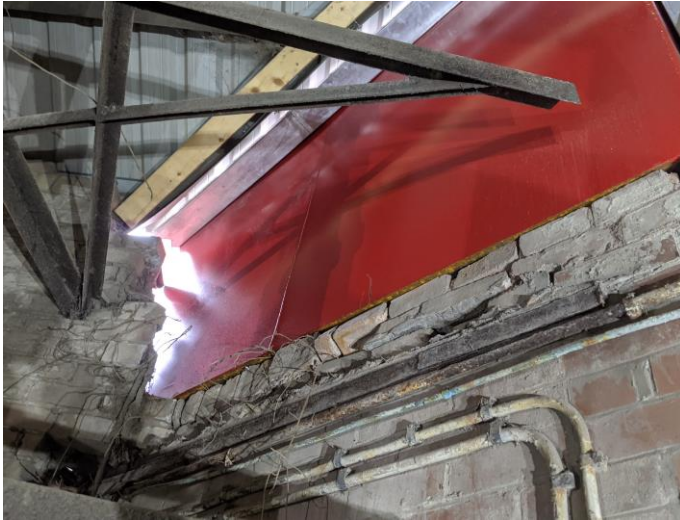
Figure 8 Gaps at the side