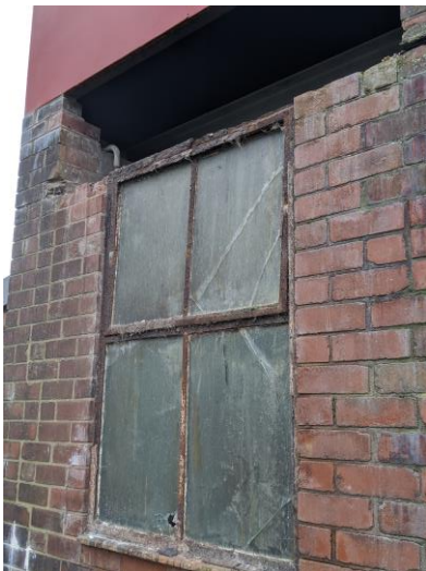
Figure 6 Gap and Window discussed