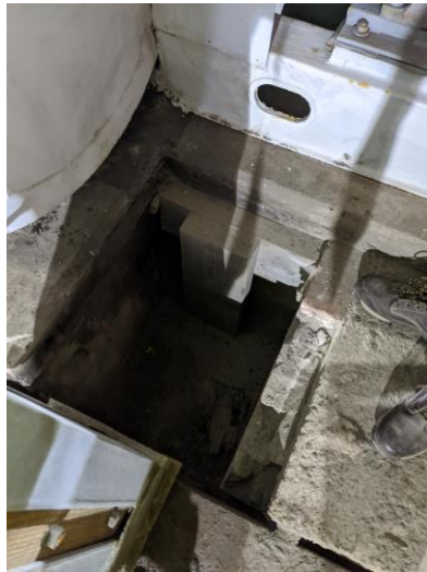
Figure 4 Timbers noted to be missing